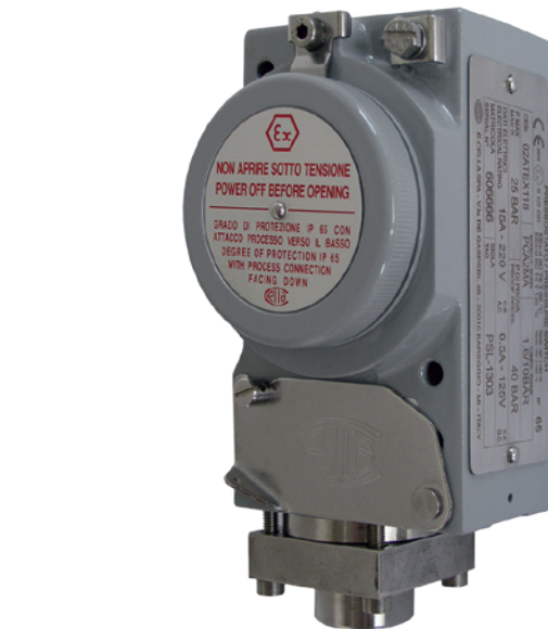
Compact pressure switch model PCA-HP

The gauge adapters are made of stainless steel, the diaphragm is, depending on the measuring range and the sensor code, made of Inconel or coated with NBR or PTFE. Each switch family is available in IP 65, Ex-ia or Ex-d versions (Ex-ia see model PCS-HP, data sheet PV 33.32).