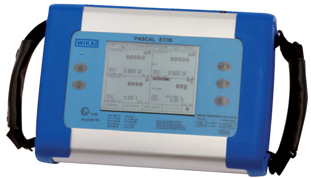
Hand-held multifunction calibrator model Pascal ET/IS