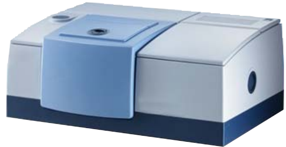
Measuring system for laboratory analysis, model GFTIR-10