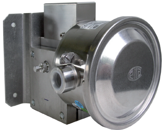
Differential pressure switch model DW