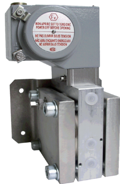
Compact differential pressure switch model DEA