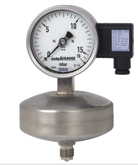
intelliGAUGE® model PGT63HP.100